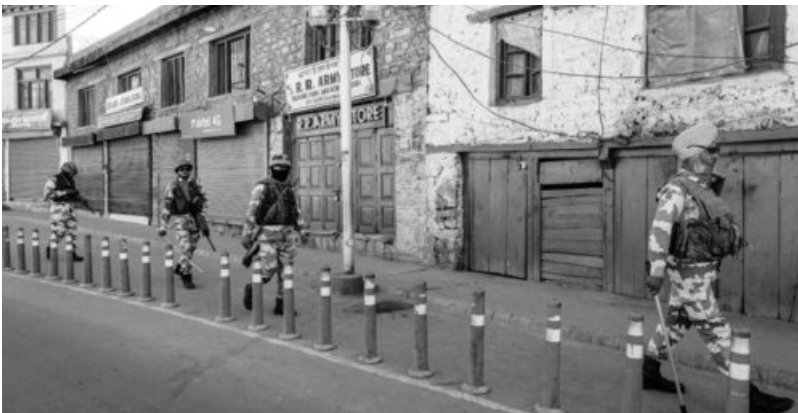
Security personnel patrol an area during a curfew after protests in Leh, on Friday

“To say it was instigated by me is to find a scapegoat, rather than addressing the core of the problem, and this will lead us nowhere,” Wangchuk said on Thursday, adding that the violence was a symptom of frustrated youth.